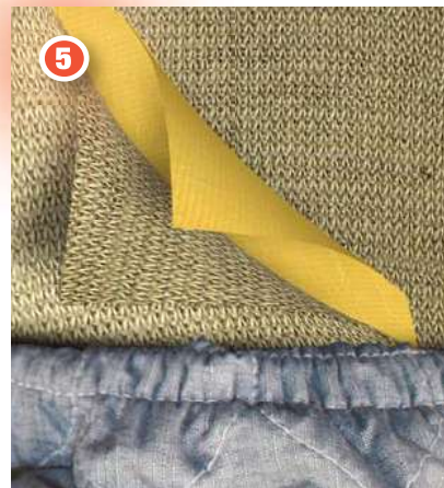
Leg Guard (Interior Detail)

To learn more about LION TotalCare PPE maintenance services and state-of-the-art fire training products, visit lionprotects.com